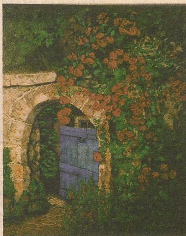
'Garden Gate,' above, a 20-by-24-inch acrylic, is $995. 'Five Apples,' right, an 11-by-14-inch acrylic painting, is $195.